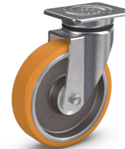
VULKOLLAN® industrial swivel castors