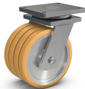
VULKOLLAN® heavy-duty swivel castors

Our wheels and castors for mobile stairs and docking systems have proven successful in the maintenance and production of aeroplanes throughout the world. They feature low starting and rolling resistance and make it easier to ensure precise positioning. High load capacities are possible through the use of high-quality wheel material.