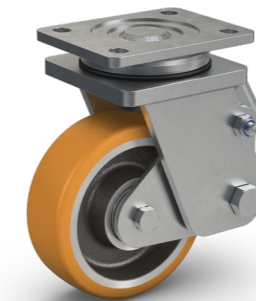
PEVOPUR® heavy-duty swivel castors