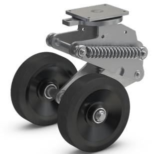
Spring-loaded solid rubber heavy-duty castors

Lifting and support equipment play an essential part in aerospace technology. In addition to the high load capacity and durability of all components, maximum precision is also required. The use of Mecanum wheels enables precise, direct positioning without any extensive time-consuming manoeuvres.