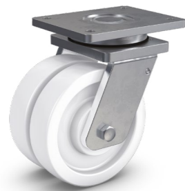
PEVOLON® heavy-duty castors