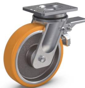
PEVOPUR® heavy-duty swivel castors